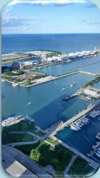
View of Navy Pier

On Saturday, September 10, we hosted a Thank You & Appreciation Reception for committee members and volunteers in Illinois.